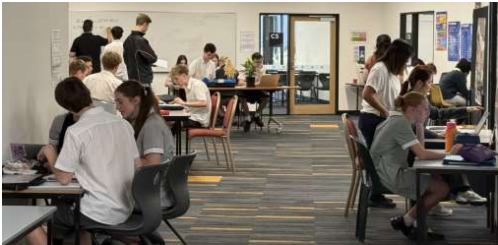
Senior Maths Support