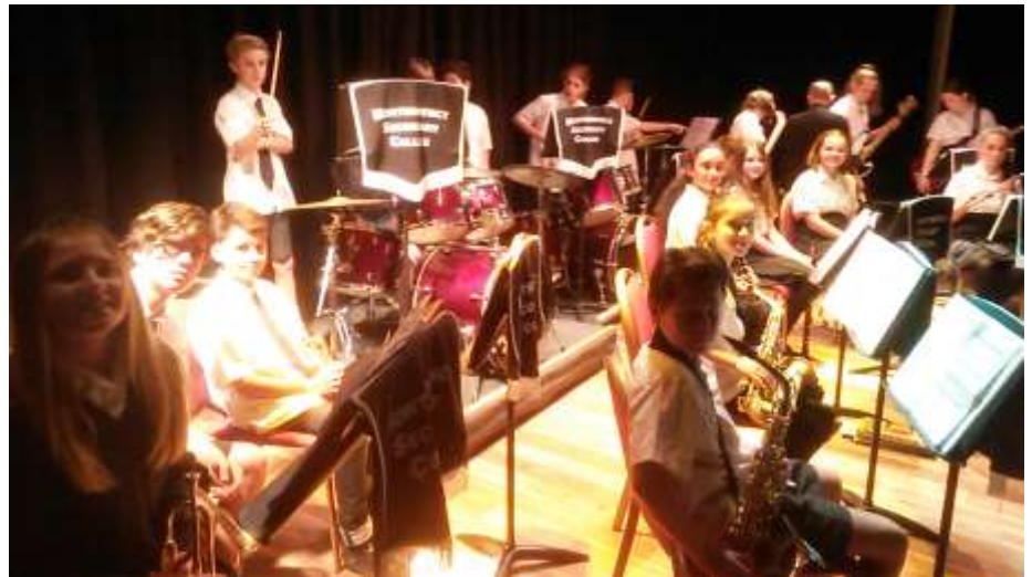
Rookie Band on stage and waiting for the curtains to go up

While the students had some opportunity to hear their peers on concert night it isn't always possible to see the entire concert and hence not all performers and friends. To help students develop individual performance skills and share their individual work with their peers the students get the opportunity to play for each other. This was a fabulous event and it was wonderful to see various combinations of instruments from solos to trios (eg Double Bass, 2 Violins), bass Guitar Trio, Guitar ensemble, Ukulele and voice and many more. Some students were very enthusiastic even as audience members (!!!) but everyone seemed to have fun. On the lunch bell we all indulged with some pizza to end the event.