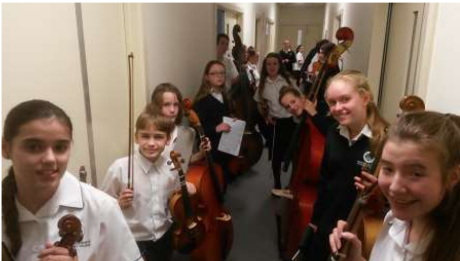
Rookie Band on stage and waiting for the curtains to go up.

Over the two days, all ensembles rehearsed with intensity to help boost their learning. The best part of course is the bonding that occurs between students as they get to know students from other classes and year levels. The groups involved in this event were: Junior Strings, Intermediate Stings, Rookie Band, Intermediate Band, Senior Stage Band, Choir, Percussion Ensembles and Guitar Ensemble.